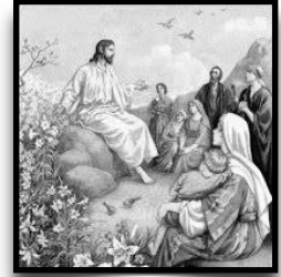
Jesus with co-ed "groupies".

"FIELD TRIP!!" Sound familiar? I wonder how Jesus managed such an on-foot excursion with 72 (count them--seventy-two!) folks? (Recall that "the disciples" were co-ed groupies of Jesus.) Included with this group, were the 12 "chosen ones" called "the [original] Apostles."