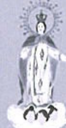
Our Lady of Mercy Sept. 24