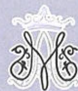
Most Holy Name of Mary Sept. 12