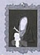
Our Lady of Sorrows of Turamba Sept. 18