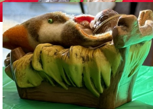
Baby Jesus swaddled in the manger.